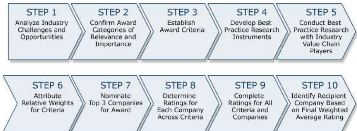
Chart 2: Frost & Sullivan's 10-Step Process for Identifying Award Recipients

This exercise encompasses all criteria, leading to a weighted average ranking of each company. Researchers can then easily identify the company with the highest ranking. As a final step, the research team confirms the veracity of the model by ensuring that small changes to the ratings for a specific criterion do not lead to a significant change in the overall relative rankings of the companies.